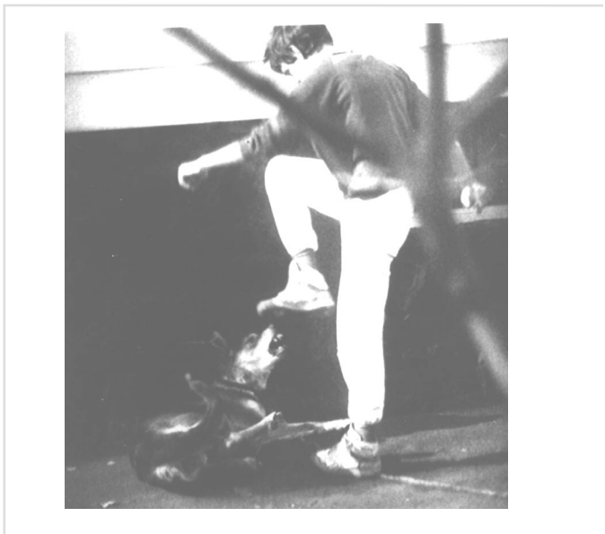
More and more research has revealed that acts of cruelty to animals often lead to acts of cruelty to children and other people.