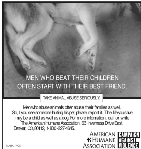
American Humane launched its Campaign Against Violence to call public attention and awareness to animal cruelty and the Link.

of animal abuse. Similar efforts soon followed in Colorado, Connecticut, and California.