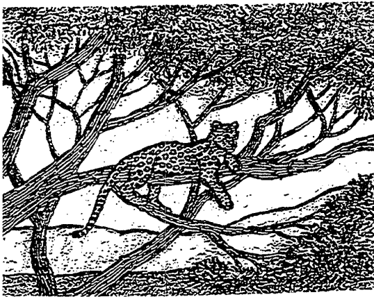
2. a leopard in the jungle