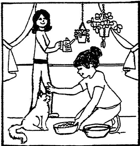
4. a pet cat