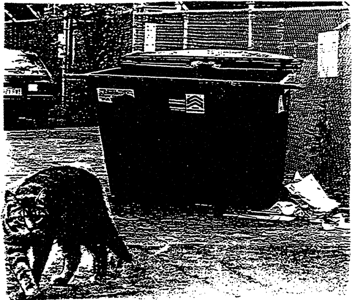
5. a stray cat